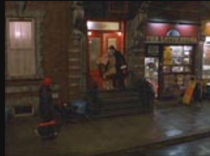
Bill is taking a risk with Domino. Isn't it funny that she lives next to a lotto store?