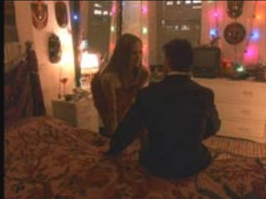
Heart of Darkness: Isn't it in the nature of this dreamy film that Domino's bedroom would be decorated in an Africa theme? Notice the African masks on the walls, and the mock-Congo flowing along the floor.