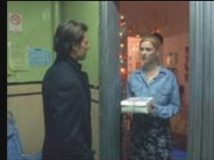
Fitting in with the sexual themes of Eyes Wide Shut is an advertisement taped up in the lobby of Domino's apartment building: REICH ORIENTED PSYCHOTHERAPY.