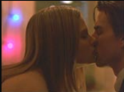
These glowing lights look as sick as Domino. They're flaring up , like sores, or a rash.