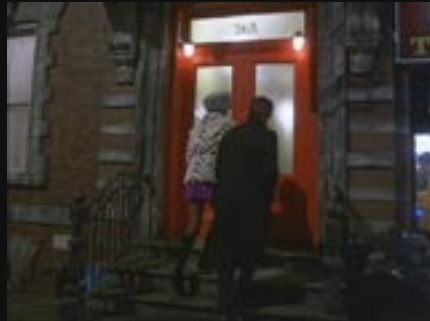
The building number is 265. 2 + 6 + 5 = unlucky 13. Isn't red the international color of warning?