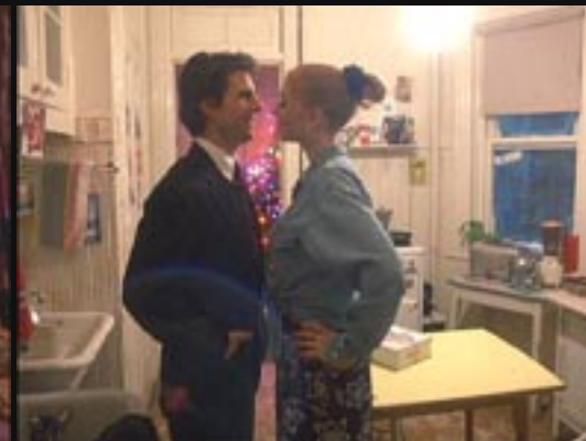
NUALA: "Don't you want to go where the rainbow ends?"