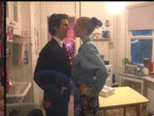
NUALA: "Don't you want to go where the rainbow ends?"