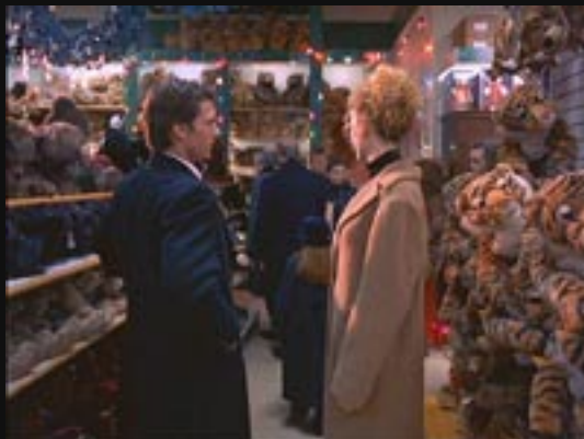
Domino has a tiger on her bed. In the last scene of the film, Bill and Alice speak their last lines of dialogue while standing alongside a display of these exact same tigers.